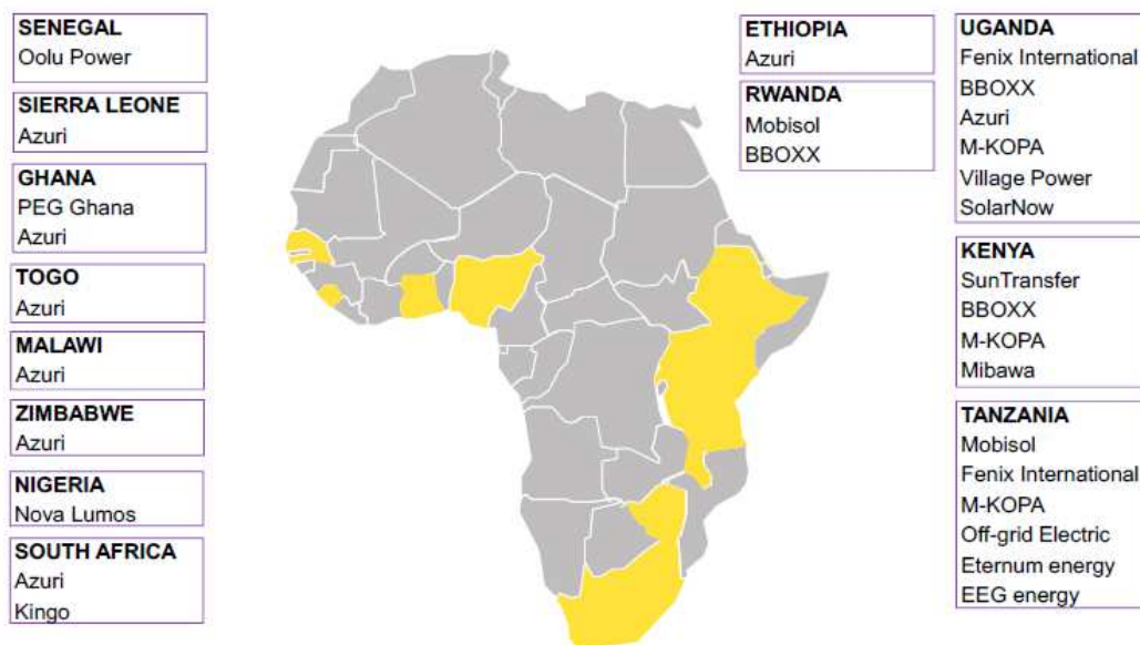
Figure 35: Pay-as-you-go solar lighting services currently available (portable lights and solar home systems)

Note: The list represents a sample and does not claim to be comprehensive.