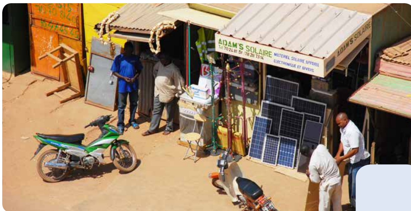
Photo: “Ouagadougou shop” by Wegmann is licensed under CC-BY-SA-3.0

Overall, there remains a significant need for climate finance that is prepared to take on more risk and that is suited to smaller investment projects. A suite of public finance and risk mitigation instruments is called for, targeted at critical finance gaps that can take climate technologies from the research, development and demonstration (RD&D) stage through to commercialization, and large-scale diffusion in new markets. Public finance and policy and targeted capacity-building efforts therefore remain key drivers of investment in low-carbon and climate-resilient technologies.