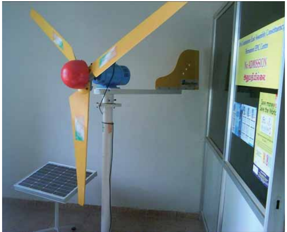
A model of a hybrid wind-solar PV system educates visitors to Coimbatore's REEERC.

Interventions with multiple benefits are best: The water sector energy audit enabled the CMC to identify methods of energy conservation while at the same time improving their services and providing services to a greater population.