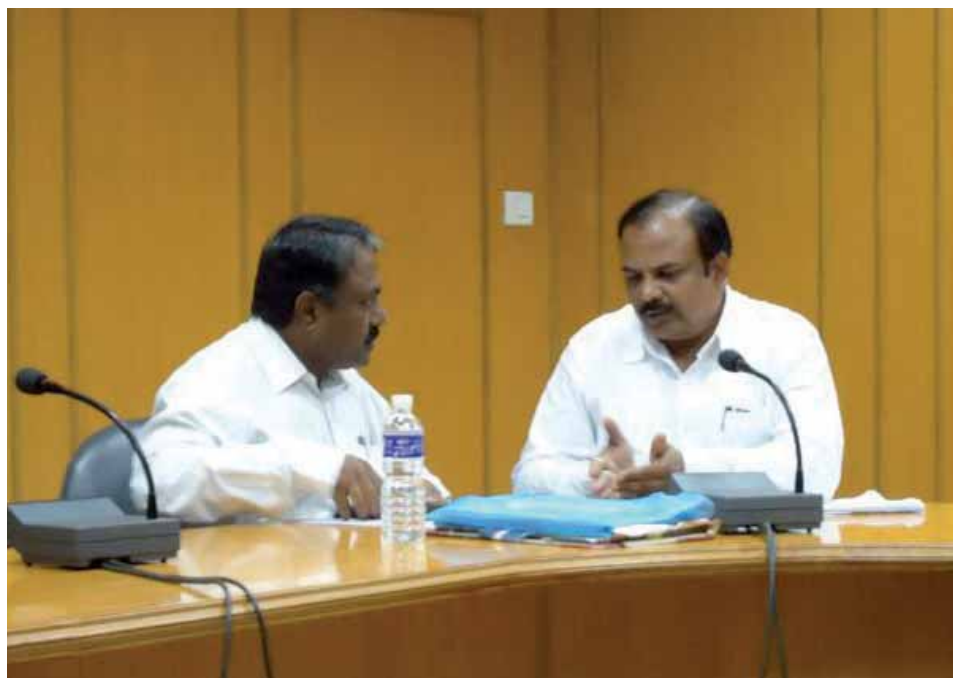
The CMC and NMC engineers in discussion during a city exchange visit facilitated by the Local Renewables project in Coimbatore in 2010.