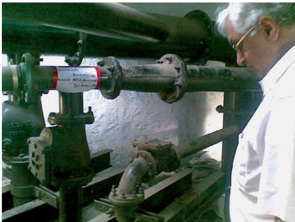
An external consultant visits tube wells in Coimbatore while conducting the pilot energy audit of the system in 2009