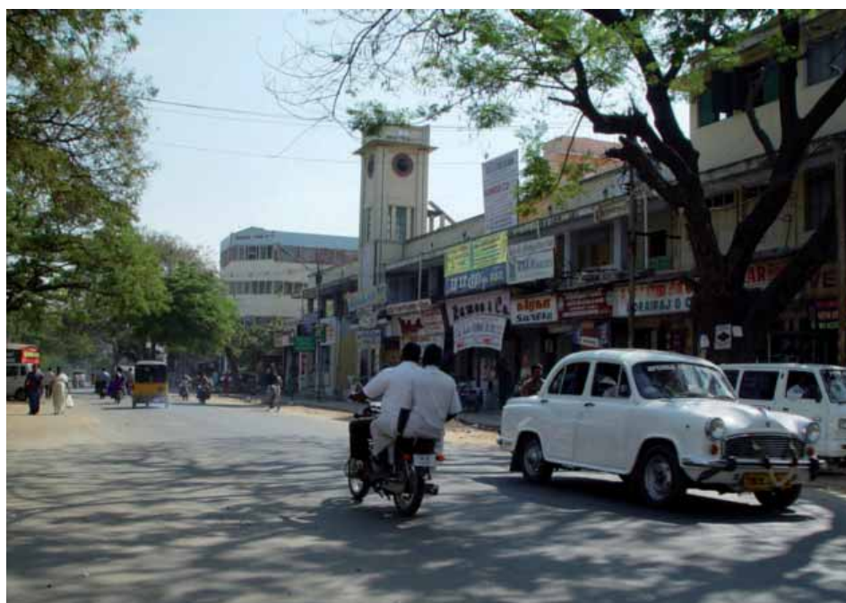
A street in Coimbatore, India