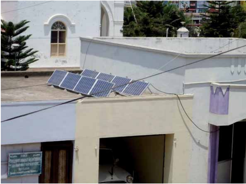
Solar panels on the roof of the Coimbatore resource center. These panels are connected to a power back up system that provides electricity to the resource center and other municipal departments during a power cut.

Bus terminal energy efficiency: The energy savings expected after switching over to energy efficient CFL and T5 fluorescent light fittings are around 136,000 kWh per year and the amount of monetary savings will be around 444,000 INR per year.