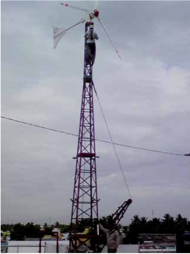
A worker puts finishing touches to the wind-solar PV hybrid system that will serve as a power back up to the Mettupalayam road bus terminal in Coimbatore. The installation was completed in 2010.