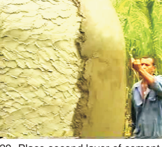
29- Place second layer of cement