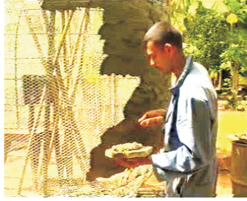
28- Place first layer of cement