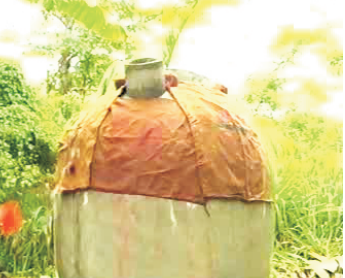
33- Allow tank to cure