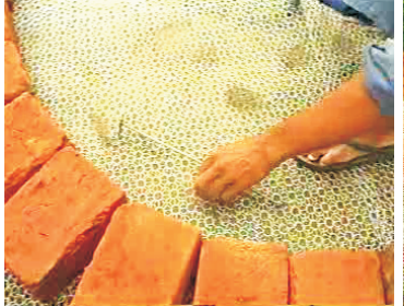
13- Place bolts within circle