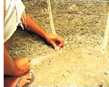
35- Remove nuts at frames