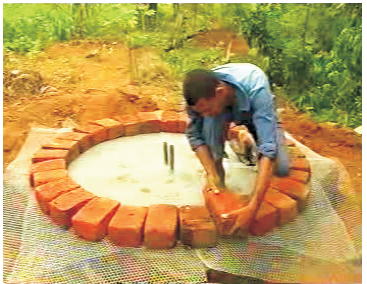
12- Place bricks around 4'-0" circle