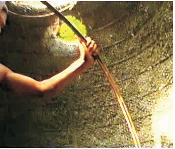
36- Remove frames