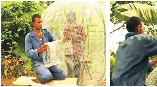
26- Fabricate mesh cylinder

Prepare a cylindrical shaped roll of chicken mesh that is sized so as to accommodate a plastic bucket (typically 1 2 litre bucked used for paint). Provide for a 10" extension of the mesh cylinder. Make about 4 or 5 cuts to a depth of 10" in the extended part of the cylinder as shown in the drawing. Place the mesh cylinder on the top surface of the tank structure in a location closest to the incoming rainwater pipe from the gutters of the building. Tie the splayed ends of the cylinder to the mesh envelope and metal hoops.