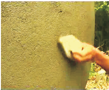
31- Smoothen outer surface