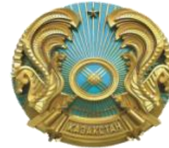
Ministry of agriculture