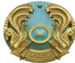
Ministry of Foreign Affairs