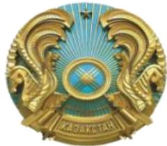
Ministry of Energy