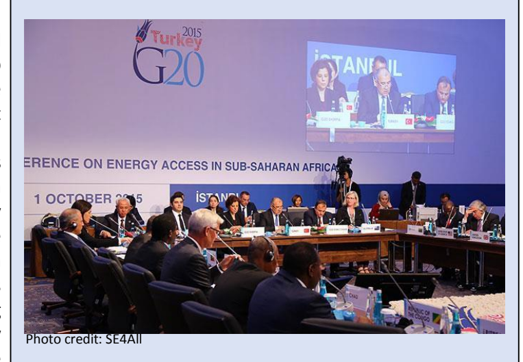
We hope that in the course of 2016 this endorsement will result in further partnership and support with the HIO in the run up to the Chinese G20 Presidency.

"Support collaborative efforts such as those of the Sustainable Energy for All High-Impact Opportunity on Clean Energy Minigrids including the Africa-focused Green Mini-Grid Market Development Program".