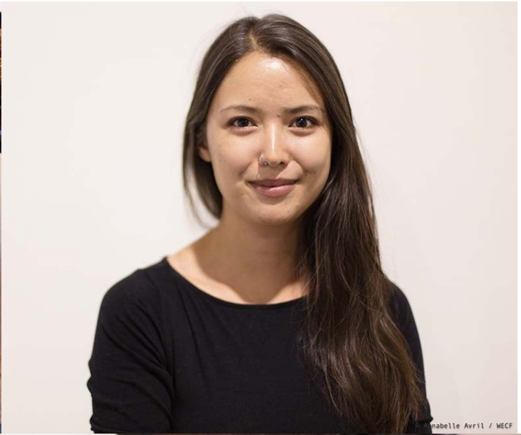
Isabelle Avril / MECF