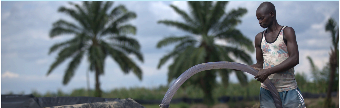
Farmer fills the SLAMDAM barriers with water to protect his crops from flooding

Areas of Burundi are exposed to both floods during the rainy season and droughts during the dry season, both worsened by climate change and destroying crops. To address this, SLAMDAM, a low-cost, climate-resilient, and easily replicable solution of rubber barriers was deployed.