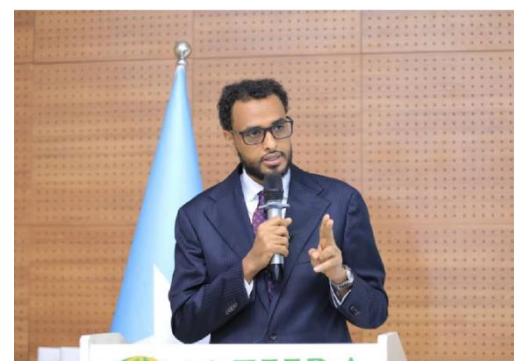
Figure 3: H.E. Ahmed Osman, State minister of MoCT delivering opening remarks.

Venue: Jazeera Palace Hotel, Mogadishu, Somalia