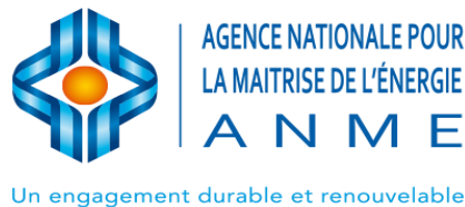
National Energy Management Agency (ANME)