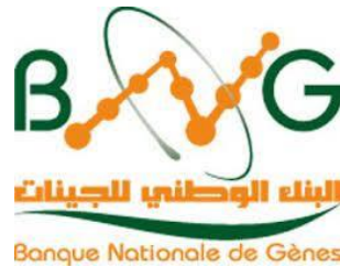
National Gene Bank (BNG)