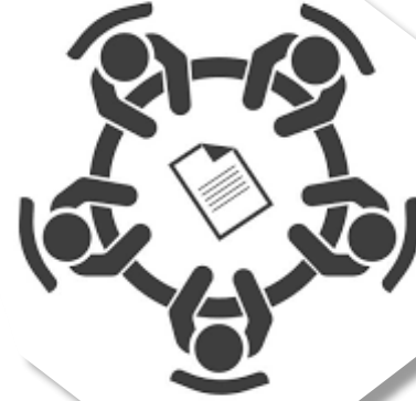
(A/C). G1. TABLE