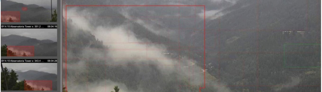
The Borjomi-Kharagauli National Park in Georgia.

The Borjomi-Kharagauli National Park faces threats from uncontrolled forest fires, exacerbated by climate change. This project implements an integrated monitoring and early warning system for forest fire detection using innovative remote sensing tools. This aims to protect the park's ecosystems and biodiversity by enabling timely and effective fire prevention and response, enhancing the resilience to climate-related hazards.