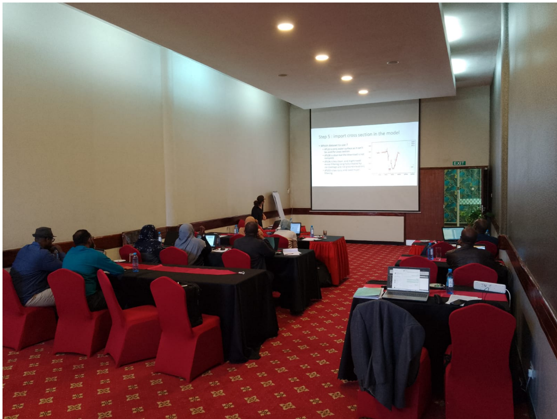
Workshop: Technical training session for developing hydrodynamic models

Dissemination of alerts: Flood alerts are automatically disseminated by e-mail