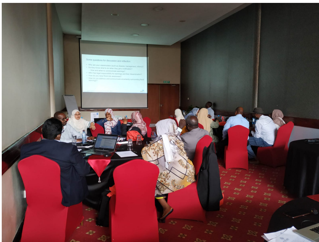
Workshop: Group discussions by stakeholders during the one-day workshop