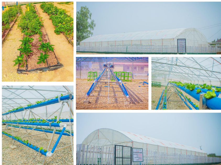
The exterior and interior view of the solar-powered hydroponics system shows the Nutrient Film Technique (NFT) and trough systems.