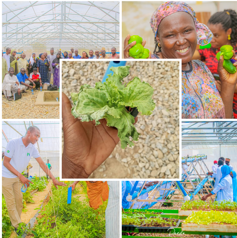
Pictures showing beneficiaries of the EMSAS-Hydroponics in the solar-powered hydroponics system during training, highlighting crop planting, management, and harvest.