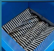
Inside the crusher