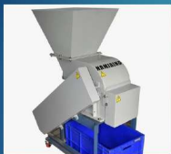
Organic waste shredding machine

A shredding machine cuts biodegradable waste into smaller particles