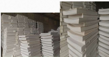
Unbleached paper Board