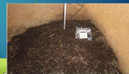
Dump shredded biodegradable matter into a pit for gas