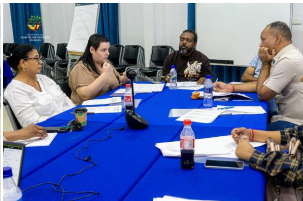
Figure 2 SWG Workshop #01 discussion group 2; PoER