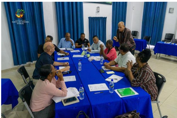
Figure 1 (Part of) SWG Workshop #01 discussion group 2; SWG

See MoM SWG Workshop #01 dd 0512/4 v 090125.