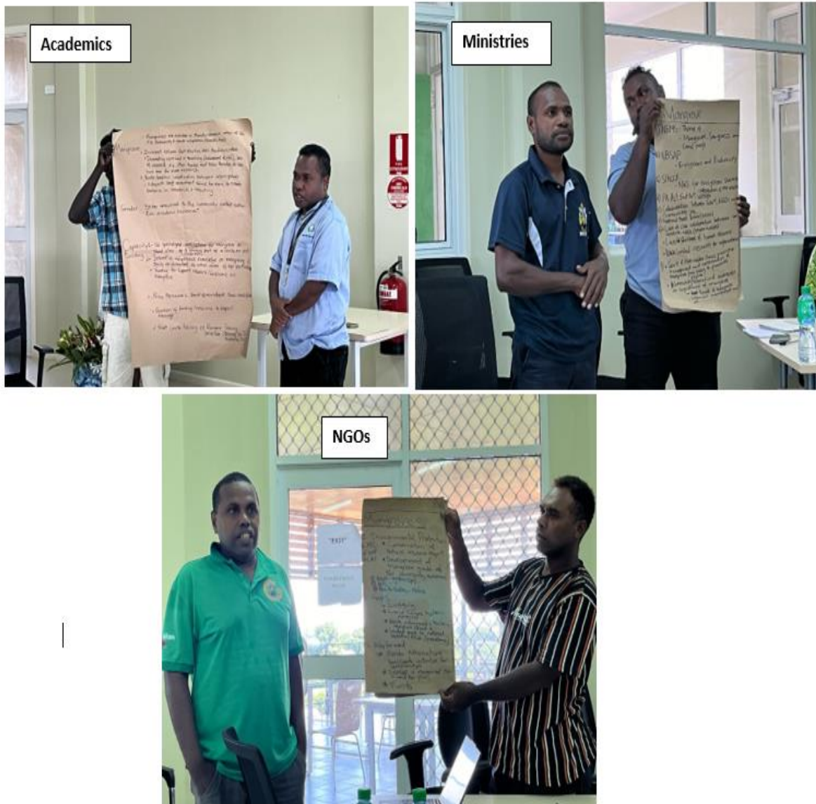
Figure 2. Group discussion presentation from SINU Academics, Ministries and NGOs during the Workshop