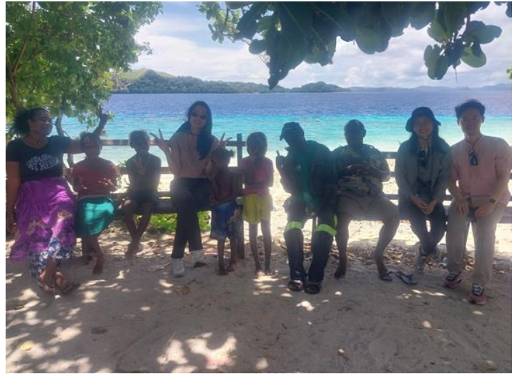
Figure 4. Workshop participants and the community elder during the field trip to Naghotano community, Ngella Island.