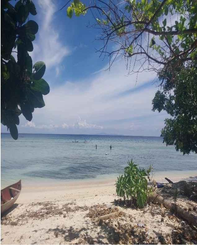
Figure 3. Coastal area where mangrove species are replanted at Naghotano community, Ngella Island.