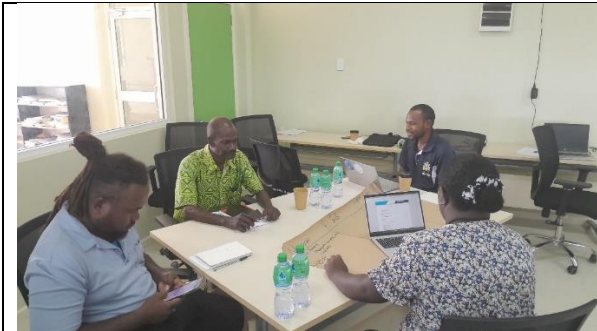
Figure 1.(Photo).stakeholder group discussions- Government Ministries (CCD & ECD of MECDM, MOFR, MFMR representatives) at SINU science lab conference room, Kukum campus, FAFE. Honiara. Source: Veira P, 29 th Feb 2024