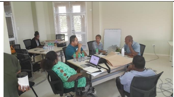
Figure 4: Academic representatives open discussion sessions on Mangroves, Gender and Capacity Building, SINU FAFE. Honiara.