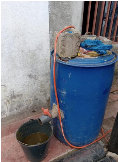
Figure 3. Home-made 200L biodigester.

A homemade biodigester system was also visited in Manica province to understand the existing technologies. This is made by a 200 litres tank and homemade filters that allow for the sulfuric acid to be evaporated. The inputs required for the prototype are food waste and water from a dog (which could be replaced by ruminant excreta due to its high fibre levels). A 200-litre tank can produce up to 0.9m 3 per day. There are no expected dangers of using this type of prototype. There have been efforts to distribute the homemade technology, but it has not been taken up properly by the farmers.