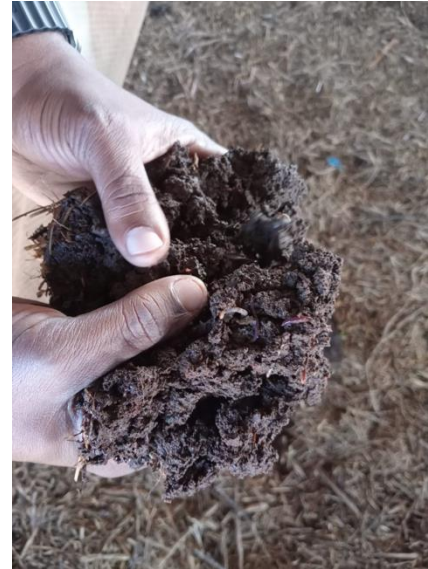
Figure 2. Final product (Humus) of the vermicomposting process.

In 2020, CITT developed a technical package for vermicompost production that includes the production beds, 5 kg of red worm and a manual 4 . The manual presents an introduction to what is vermicompost and what are the raw materials required to start producing it. A clear step by step explanation with pictures is provided on the production and process and finalized with an overview of the different uses of the final product. As for the production, a ratio of 50% organic matter and 50% of excreta is mixed and watered every week to produce the humus after 2 months.