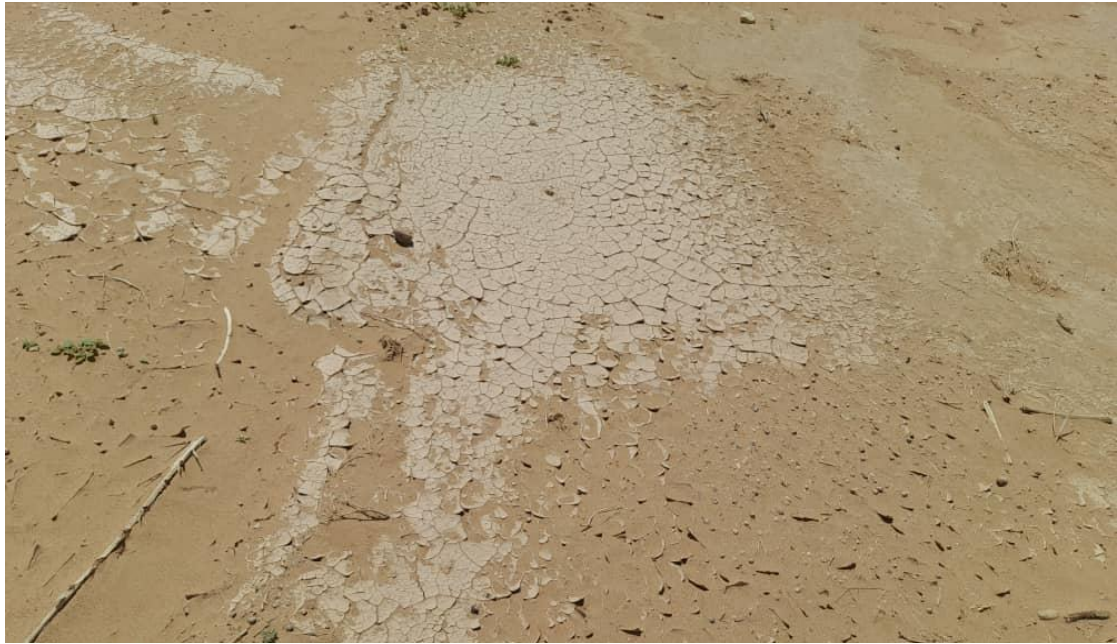
Figure 3: Crusting of the topsoil