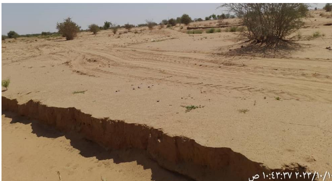
Figure 5: Building up of deep channels (gullies)