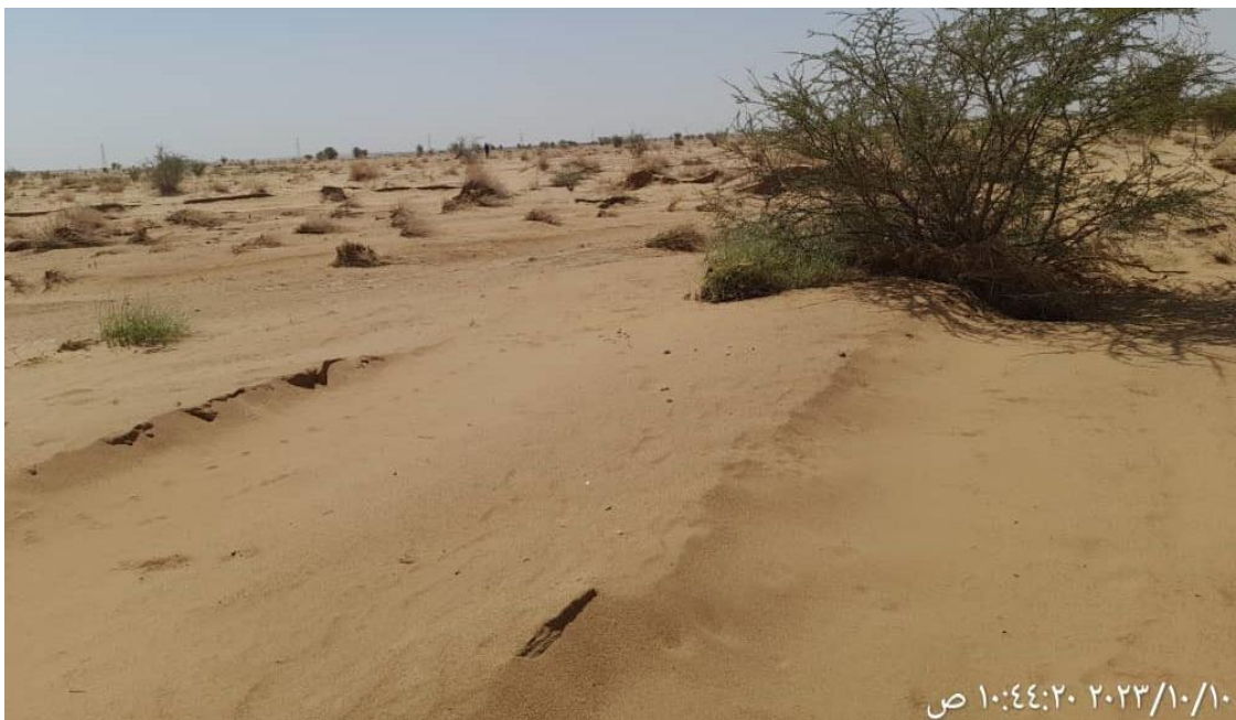
Figure 4: Presence of sand depositions