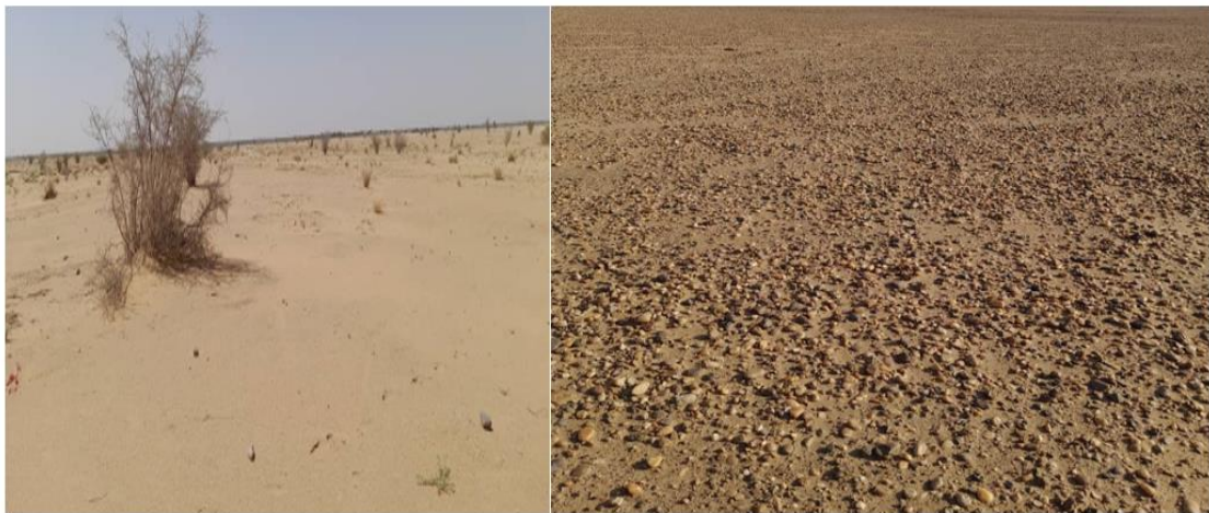
Figure 1: Absence of vegetation cover (left) and presence of armoured layer (right), illustrating the ongoing erosive processes in Al Damar

Soil is a fundamental and irreplaceable natural resource, supporting the survival and socio-economic well-being of the inhabitants of Al Damar in the River Nile State (RNS) of Sudan. The support is mainly achieved through small-scale agricultural activities, which are majorly confined on the banks of the Nile River. The increasing frequency of climatic extremes, particularly droughts, high-velocity wind storms, erratic rainfall, and floods has exposed the soils of the northern parts of Sudan to erosion by both wind and water (Figure 1). Anthropogenic factors, such as inappropriate land use practices and over-exploitation of the natural resource base have also accelerated the rates of soil erosion. The widespread land degradation in the form of soil erosion underpins the low agricultural productivity and per capita income levels in the area. The erosive processes could also increase the vulnerability of communities in Al Damar to future climatic and economic shocks, culminating in human destitution, abandoned unproductive lands, conflicts and migration.