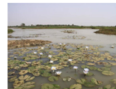
Wetland (e.g. dam of Ouagadougou)