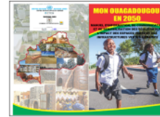
Cover of the tailor-made manual