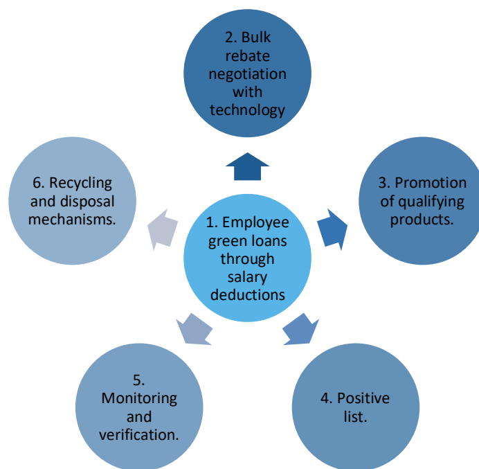
Figure 3. Financial and non-financial components of green on-wage financing

with Government institutions and private companies, to finance employees through salary deductions. The employee loan will both target customers who are government's employee (38% of survey respondents) and private sector employees (36% of survey respondents). The former target group being perceived as almost credit risk-free by financial institutions due to their employer's strong backing. Both, the burden of upfront investment and the need for collateral are hence removed or reduced, providing more liquidity and reducing borrowing costs for customers, while drastically reducing perceived risk for financial institutions. Local financial institutions in Zambia offer employee loans with repayment periods extending over a few years. Banking or microfinance institutions might be able to charge below market rates monthly to employees due to lower default risk. Employees' debt burden ratio must be between a certain maximum percentage ratio of net monthly income. Loans are normally between a minimal and a maximum amount in local currency.