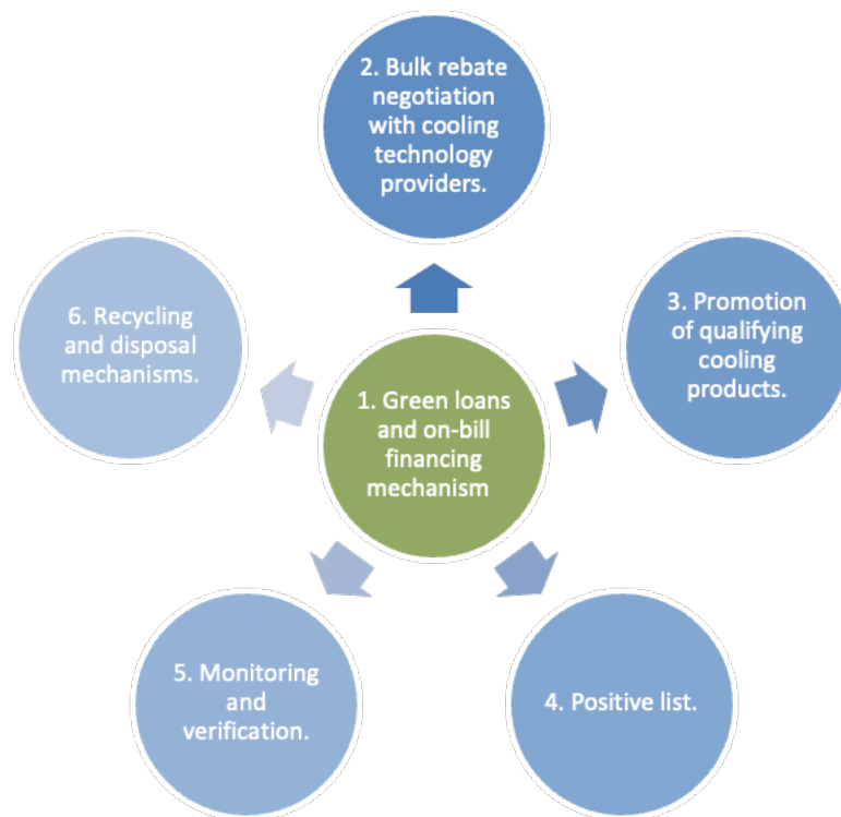
Figure 1. Financial and non-financial components of on-bill financing mechanism

1. Green loans and on-bill financing as a low-risk repayment mechanism. Zambia’s banking system is competitive. Most of the banking institutions, as well as few microfinance institutions, offer consumer loans or credit facility, which are sought after by households to acquire movable equipment and appliances. In particular, consumer loans are intended more for employees who have a guarantee through the domiciliation of their remuneration, while the other applicants must present a guarantee acceptable to the banking institutions (collaterals). The terms and conditions differ from one institution to another. Consumer loans and credit facilities mainly target employed individuals or homeowners, who can more easily provide sufficient credit capacity or some collaterals, reducing the perception of risk for local financial institutions (LFIs), but limiting the attractiveness of such a product for self-employed or non-salaried households.