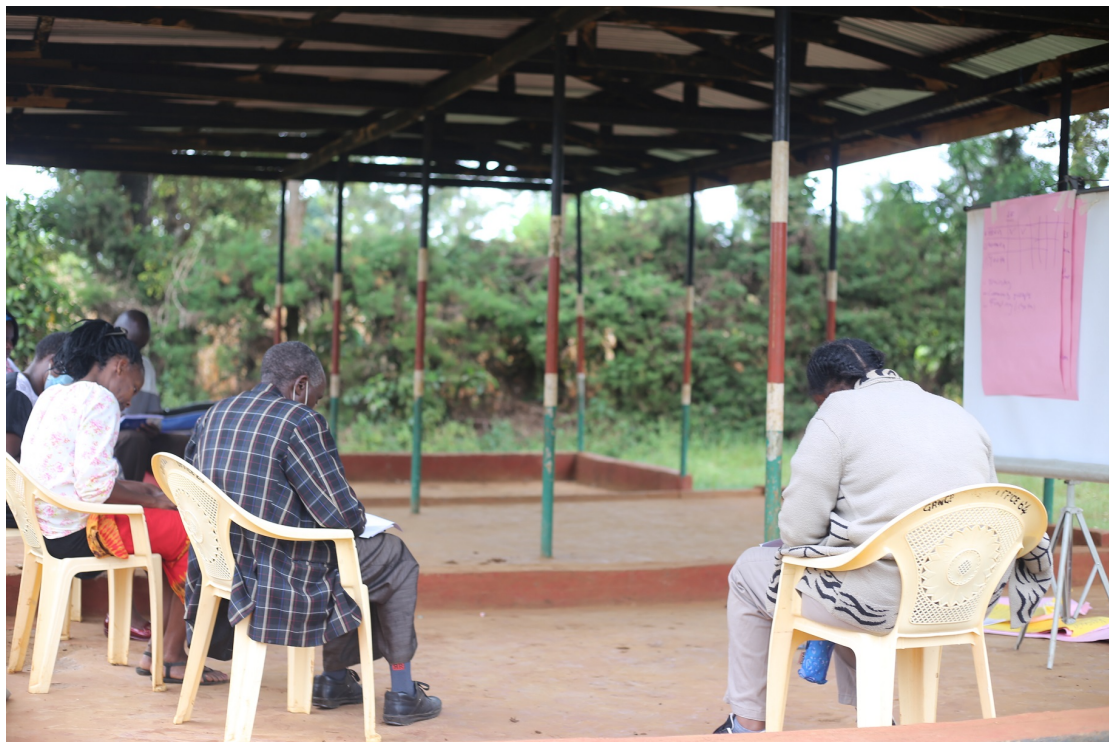
Plate 3: A community consultation meeting on the draft strategy in central Kenya