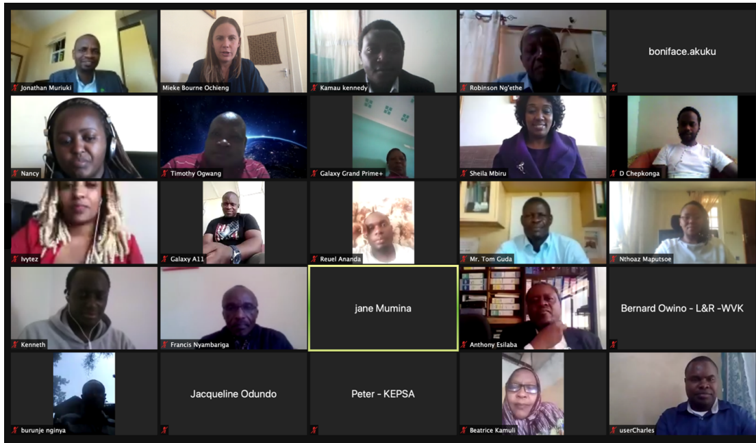
Plate 1: A screenshot of the national stakeholder consultation workshop on the draft strategy on 11 December 2020

For communication purposes, please provide 2-4 Power Point slides, including illustrations or charts, describing barriers, opportunities, methodology, activities, outputs and achieved results. The illustrations must be copied into the TA Closure report but must also be delivered as power point files. Also, please provide at least five high-resolution pictures in jpg format, capturing technical assistance. The pictures should illustrate how the TA has impacted the lives of the beneficiaries in particular and the communities in general.