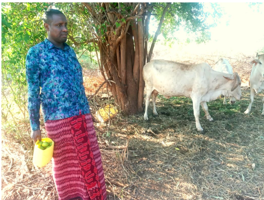
Plate 4: A farmer in Garissa demonstrates agroforestry practices during community consultations on the draft strategy in the County