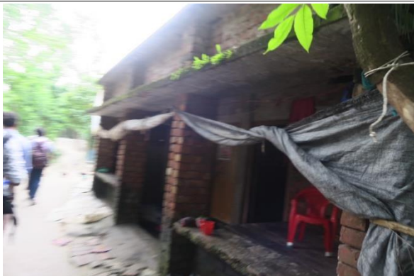
Pillars and wall with red bricks