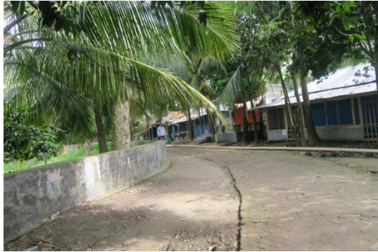
Village entrance (vehicle entry possible)