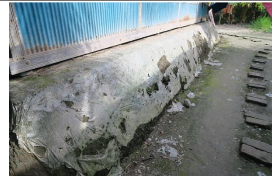
Flood damage prevention (plastic cover)