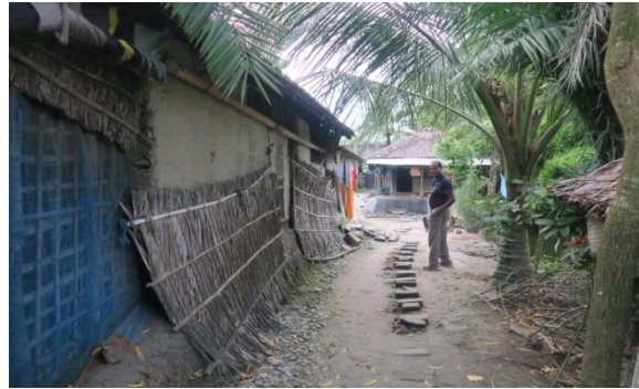
Reinforcement of the wall with Golpata