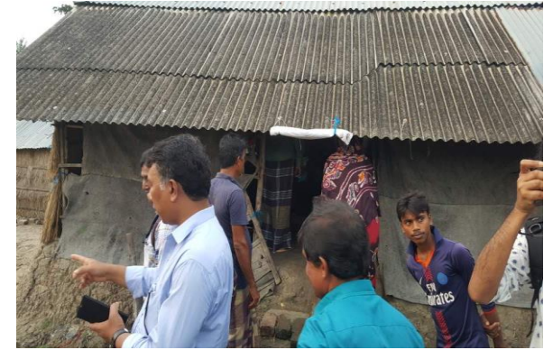
Reinforcement of the wall under slate roof