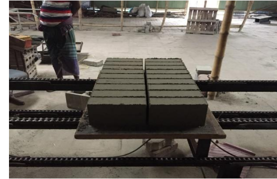
Brick factory nearby