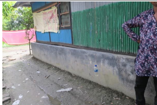
Flood damage prevention (concrete support)