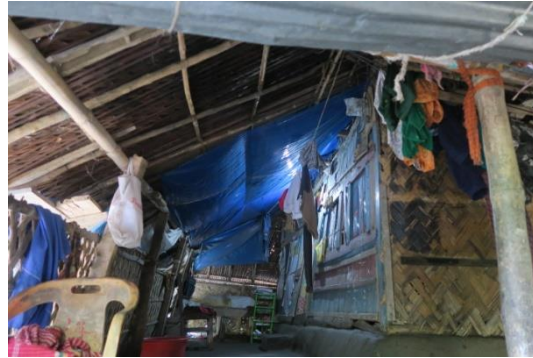
Roof seen from inside