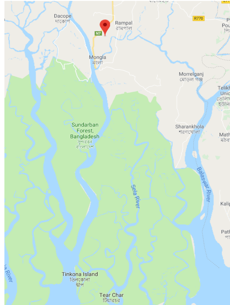
Map of Hurka, Bagerhat