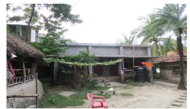
Masonry structured with bricks and Concrete slab