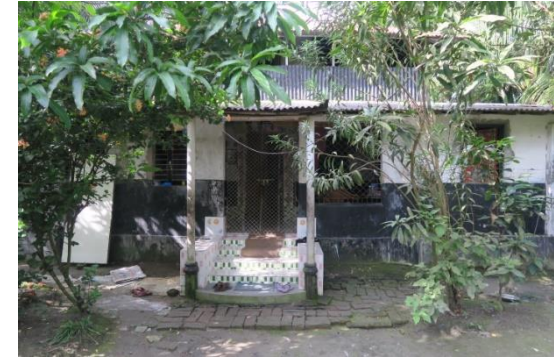
Masonry structured housing