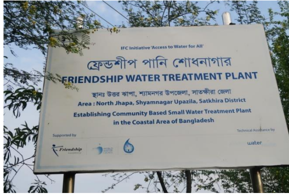
Signboard of friendship water treatment plant