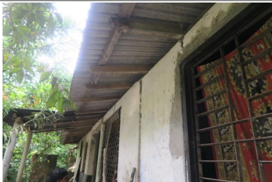
Roof made of asbestos slates