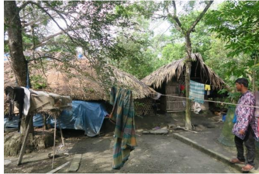
Roof structure with Golpata