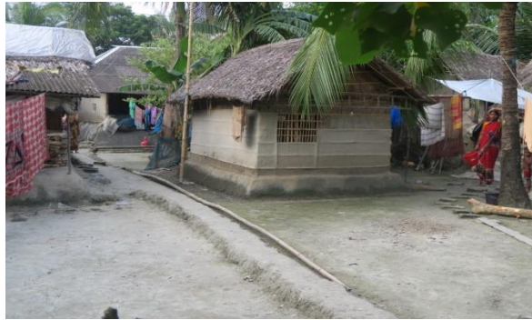
House nearby the village entrance (Golpata roof, bamboo wall)