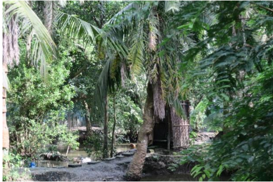
Household toilet (separated from main house)