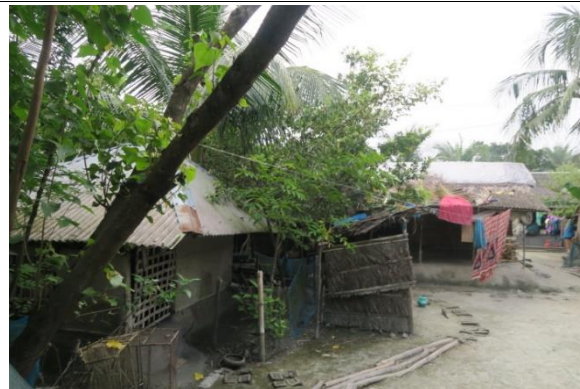
Roof with galvanized iron sheets