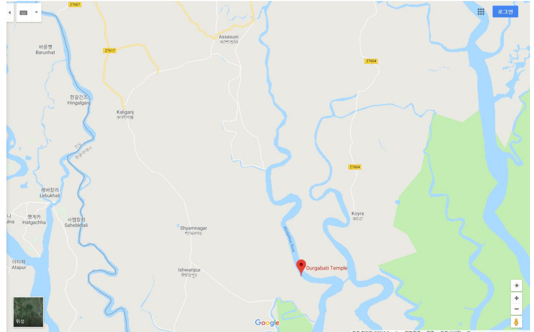
Map of Durgabati, Satkhira