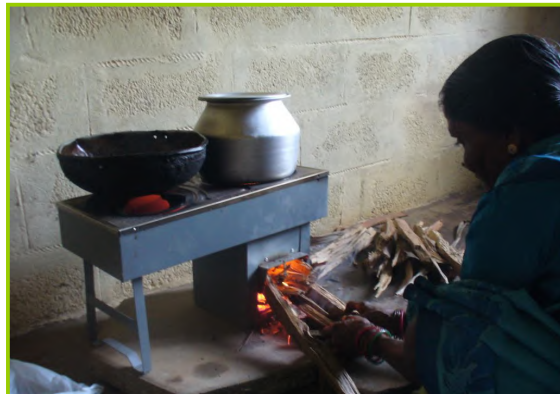
A SELCO improved cook stove during a testing workshop

SELCO has come up with products that fit these descriptions such as improved biomass stoves with a double burner and the single burner which can cook for a family of ten and five members respectively. SELCO is also providing a charcoal cooker to its customer in