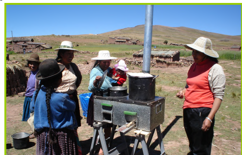
Rocket Stove in Bolivia

With the exception of Burkina Faso most projects have used direct subsidies with varying experiences. In Bolivia, a high quality and expensive metal Rocket stove for peri-urban areas was promoted. The project faced difficulties due to direct competition with subsidised LPG and increasing metal prices. Stove producers were supported with a decreasing subsidy rate, from US$26 in 2005 to US$15 in 2007. The complete subsidy withdrawal, as it had originally been planned, was hampered by increasing metal prices. Thus by mid 2008, a loan scheme was put in place to complement subsidy in the short term, eventually substituting it altogether in