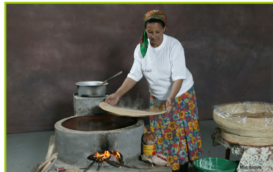
Baking Injera on a Mirt stove (GTZ Ethiopia)

In Ethiopia, direct subsidies have been used to speed up market development. Customers could buy a coupon at local banks or local agencies which they exchanged for a stove at the producer's workshop. The producer then cashed the coupon at the bank. Whereas the customers paid only two thirds of the market price, the producers got reimbursed the whole price. The sale of the first 100,000 stoves were subsidised in this way. However, experience with this system showed that a boost in stove sales was followed by a sudden