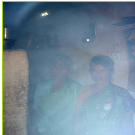
Smoky kitchen of a SELCO lighting customer (using traditional cook stove)

The pace of technology development has made super computers and flat screen televisions a thing of the past, but the choices of products for the poor remains limited. When it comes to a simple process such as cooking, this lack of choice is even more apparent as millions of people, especially women and children in the developing world suffer daily from indoor air pollution (IAP). In addition, trees from hundreds of hectares of non-sustainable forest are being cut every year to fuel the cooking needs of the under privileged population in the world.