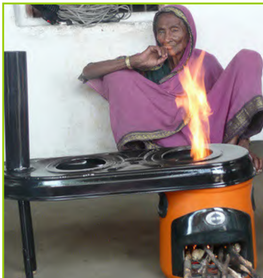
Envirofit Generation III Stove

Since the launch last year, over 80,000 cookstoves have been sold, improving the livelihood, health, social and economic status of over 300,000 people in Southern Indian states. Over the 5 year lifetime of the stoves, these benefits will add up, with over 500 million rupees of savings for India's lowest-income consumers and over 10 million hours not spent gathering fuel. This is money kept in the hands of the poor and hours saved that can be better spent on education, family time or personal enterprise efforts. The 80,000 cookstoves alone could keep over 580,000 tons of CO 2 and over 114,000 kg of black carbon from entering the atmosphere. Envirofit cookstoves' combustion technology reduces 1 ton of greenhouse gasses per stove annually and requires 50% less biomass fuel.