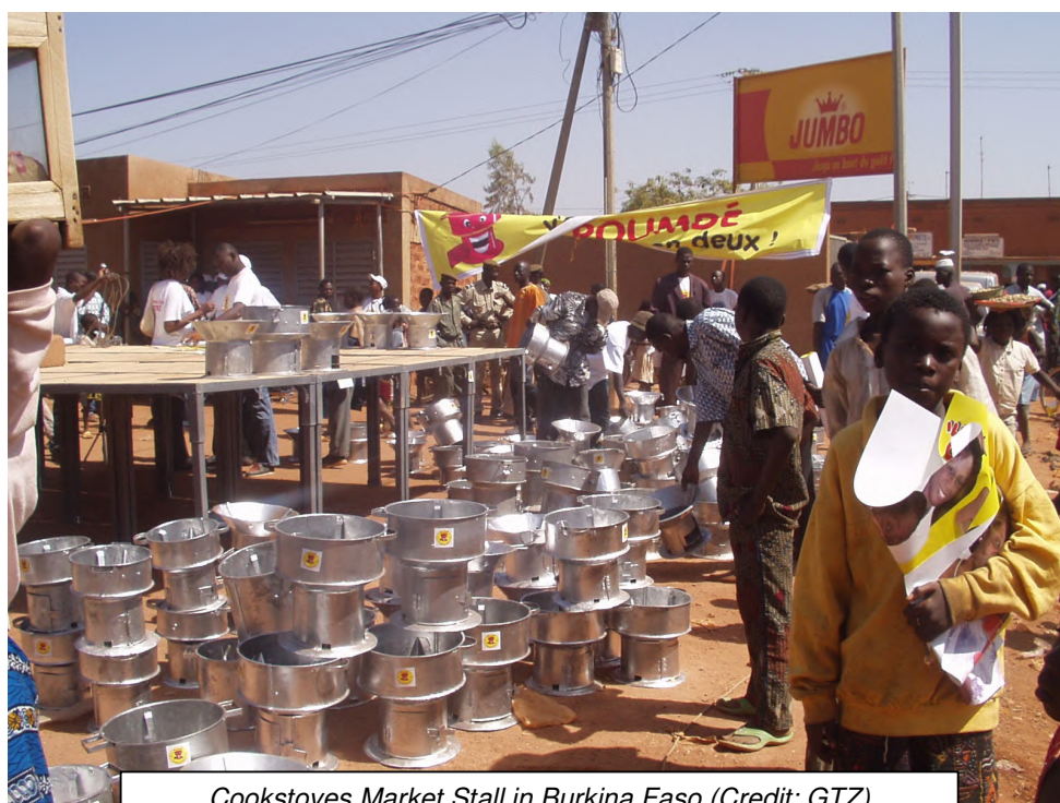
Cookstoves Market Stall in Burkina Faso