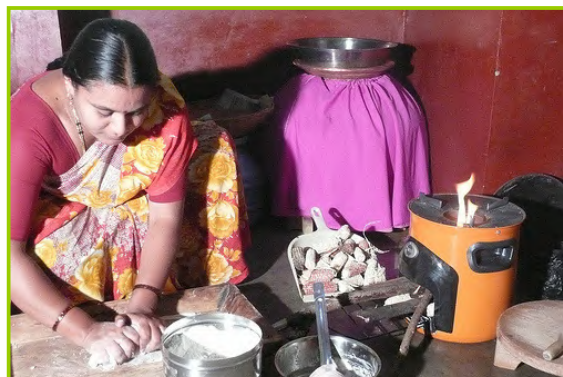
Woman preparing food to be cooked using Envirofit's Generation III Stove

From 2002 to 2007, the Foundation committed more than US$10million to nine pilot schemes to test sustainable, commercially focused cookstoves. The pilots operated across seven countries (in South East Asia, Latin America and East Africa) and involved partners with significant experience in the field, aimed to learn what worked, what didn't and then expand the best approach. This resulted in the sale of more than a quarter of a million stoves.