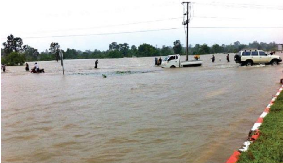
Motorists and pedestrians pass through floodwaters on 450 Year Road in Vientiane after heavy rainfalls caused by tropical storm Nock-Ten last weekend.